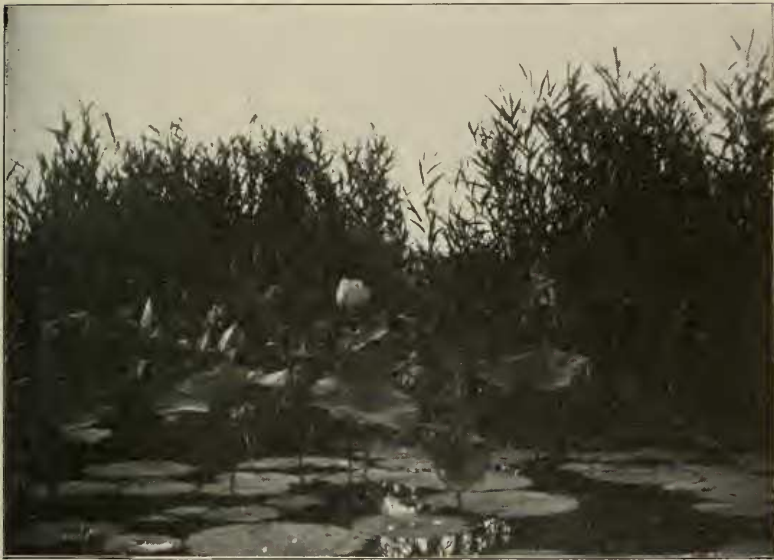
Fig. 5. In the third cove south of Biemiller's Cove. The Nelumbo lutea Consociates mingled in the left background with Pontederia cordata Society; the general background being the Phragmites phragmites Consociates of the Mars's Formation. Long-billed Marsh Wrens and Florida Gallinules prefer such places.

Judging from actual records only a few pairs breed in the marshes, and none in the inland regions. It is only occasionally common in the marshes during the migrations. The most of my